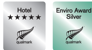
CMYK Full Colour

If you score the same in your next assessment in this area, you retain the logo you already have; and if your score increases or decreases you will be eligible to use the logo according to that score (if applicable).